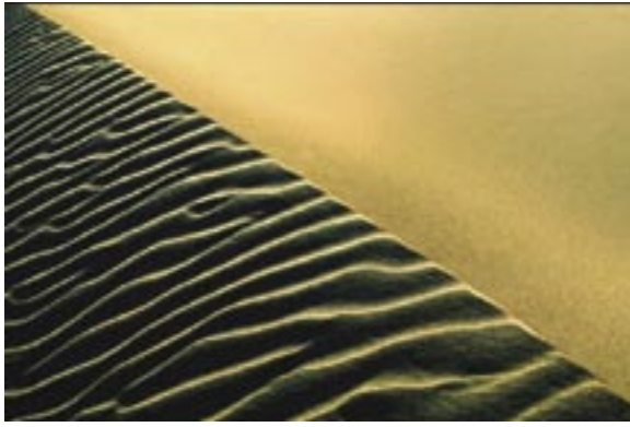
Figure 1: Appearance varies depending on surface contour and the angle of illumination.