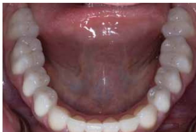
Figure 17: Postoperative mandibular occlusal view.

als with the final prosthetics, this patient was restored one sextant at a time. This way, the trauma at any given appointment was far less. No master impression required capturing more than six teeth at a time (Figs 12 & 13). This also decreased the risk of bite registration errors, which are far more frequent when doing an entire arch.