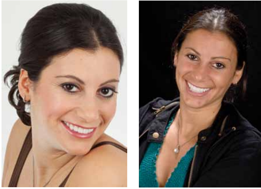
Figures 18: Images taken after the entire mouth was completed.