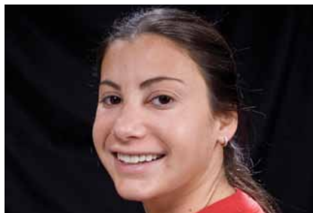
Figure 11: Left lateral view of maxillary provisionals.

portunity for growth, appreciation, and involvement in the process.