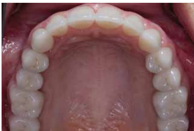
Figure 16: Postoperative maxillary occlusal view.