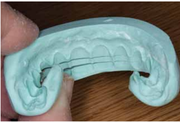
Figure 7: Laboratory putty matrix impression of the wax-up used as a buccal surface reduction guide.