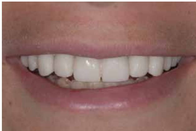
Figure 9: The patient wore indirect acrylic provisionals on the upper arch for several months.