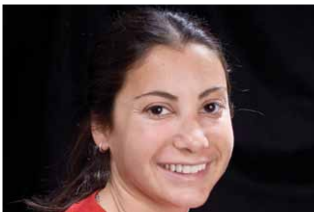
Figure 10: Right lateral view of maxillary provisionals.