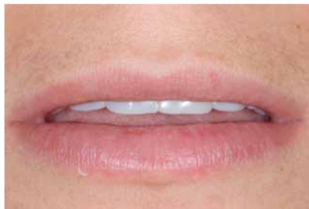
Figure 5: Commissure-to-commissure image of tooth display while the lips are at rest, or in the "M" position. 5

diagnosis. The damage to her teeth had been done as the teeth were being formed prior to diagnosis.