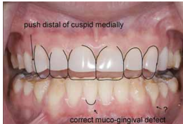
Figure 6: Line drawings of agreed-upon outline form of future teeth used as a guide in creation of the wax-up. A periodontal consultation recommended a muco-gingival connective tissue graft on the buccals of #21 and #25.