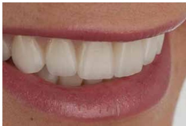
Figure 15: Postoperative lateral view of full smile.