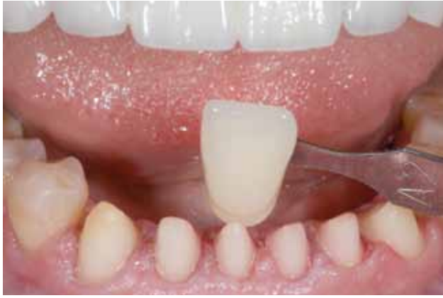
Figure 12: Stump shade prior to completing the lower front six teeth, one week after insertion of crowns ##6-11. Treatment throughout the mouth was done one sextant at a time.