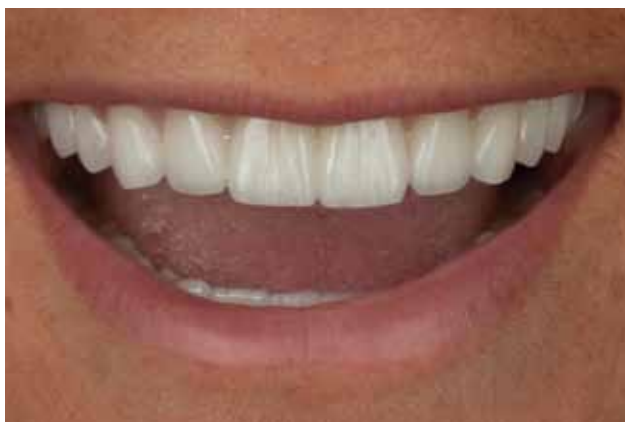
Figure 14: Postoperative full smile.