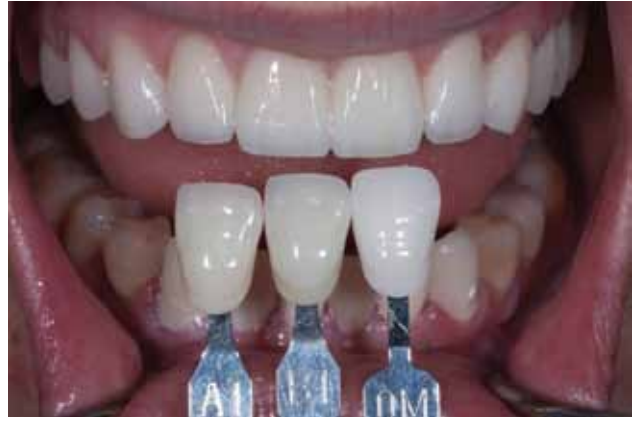
Figure 13: Shade prior to completing the lower front six teeth, One week after insertion of crowns ##6-11.

thickness. 11 The reduction guides for this case proved very valuable, as their use reduced significantly the amount of tooth reduction from the normal crown preparation. Another version of a lab putty matrix of the wax-up (Fig 8) was used to fabricate acrylic provisionals indirectly in the laboratory.