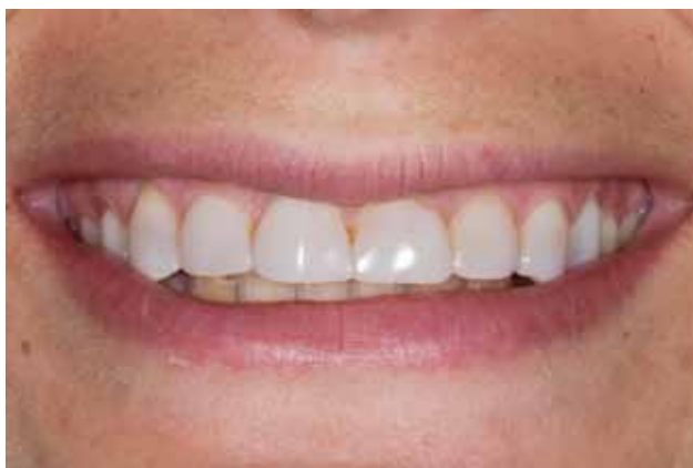
Figure 4: The recently placed composite bonding significantly improved the smile display, but the composite margins became stained soon after placement.