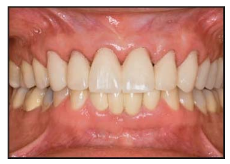
Figure 6. The provisional restorations on teeth #6 through #15 with corrected tooth alignment and fl attened occlusal plane.