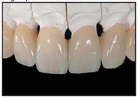
Figure 16. Restorations were glazed and polished to produce an appropriate surface luster.

with and adapting to the phonetic changes caused by modifications done to both the maxillary and mandibular incisal edges.