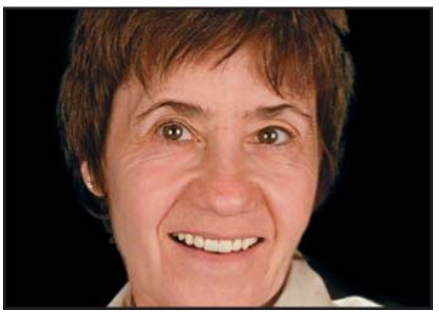
Figure 9. Portrait showing the final patient-approved provisionals that were modified to be more square.

Wearing the provisionals also allowed for patient adaptation to changes in the phonetic interplay between the teeth and to any occlusal changes that had been created by the prosthetic reorientation of teeth prior to the delivery of the final restorations.<sup>20</sup> If the patient could not adapt to these changes, it was certainly good to know this and to be able to make needed modifications prior to finishing the case. The patient wore the provisionals for eight weeks prior to feeling comfortable