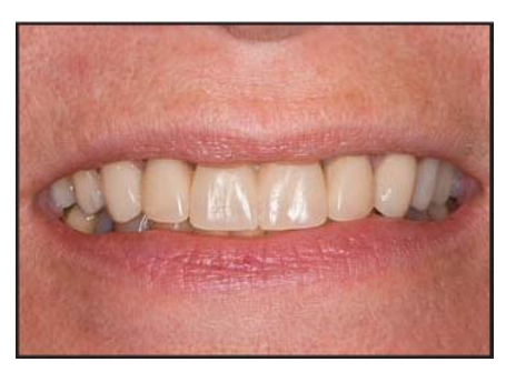
Figure 5. Extra-oral view of the acrylic provisionals on teeth #6 through #15.