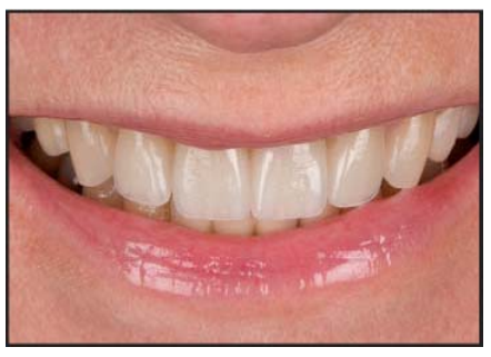
Figure 17. Varying the surface texture, gloss, translucency, opalescence, chroma, and value made these symmetrical teeth appear natural.