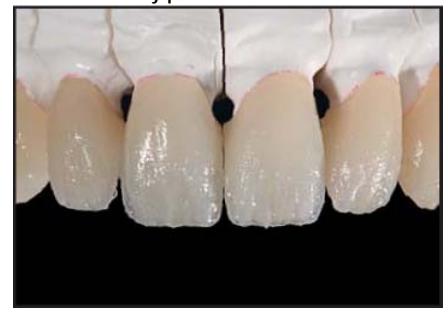
Figures 14. The fi red result of the internal effect buildup was evaluated prior to over-layering with opal enamel porcelains.