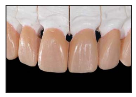
Figure 11. A full-contour wax-up was created and then cut back prior to pressing