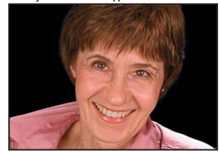
Figure 18. Postoperative facial view demonstrates improved facial symmetry and integration.