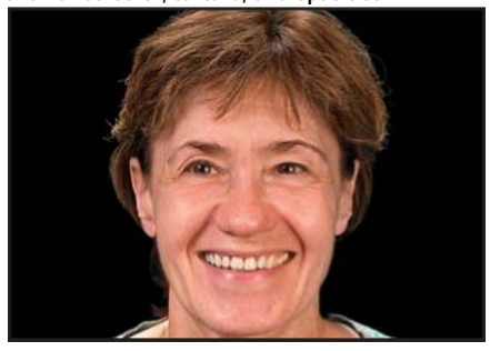
Figure 2. Patient appearance at initial presentation with facial and dental asymmetries.