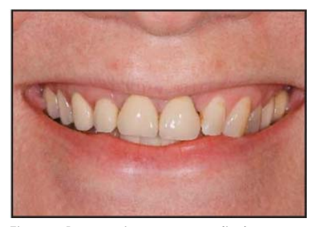
Figure 1. Preoperative appearance displays an uneven occlusal table, asymmetric gingival display, and varied color, texture, and opacities.

To even the gingival height discrepancies and to reduce the gingival display, crown lengthening was planned for teeth #6 and #7, and #11 through #13 (Figure 3). Tooth #14 was a pontic. A surgical template which