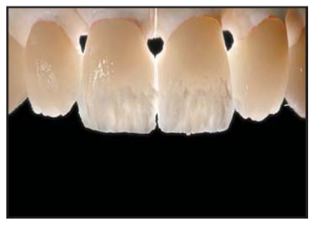
Figure 13. Internal incisal effects were established with the fl uorapatite veneering porcelain and translucency patterns were evaluated.