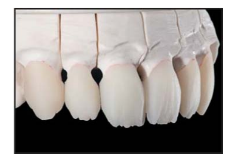
Figure 12. After surface finishing and fit verification, the pressed restorations were ready for florescent staining and application of enamel layering ceramics.