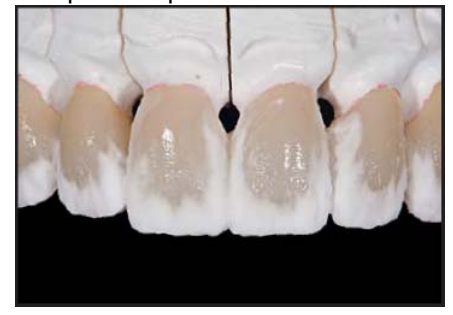
Figures 15. Opal enamel ceramics were used to fill out the restorations to ideal contour, internalizing the preestablished effects.