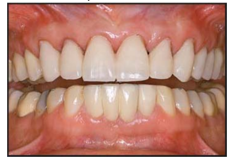
Figure 7. The edges of teeth #22 through #27 were flattened to allow for smooth transitions with anterior guidance.