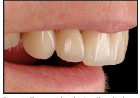
Figure 8. The crown lengthening allowed a longer length-to-width ratio of the teeth and a more feminine appearance, which the patient was unsure about.

indicated the desired post-surgical tissue heights was constructed and delivered to the periodontist.<sup>1-3</sup>