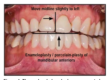
Figure 4. The occlusal plane had an exaggerated Curve of Spee, and the mandibular incisal edges were canted and uneven.

Figure 3. The occlusal plane hung down on left side and the axial inclination of the central incisors was slanted.