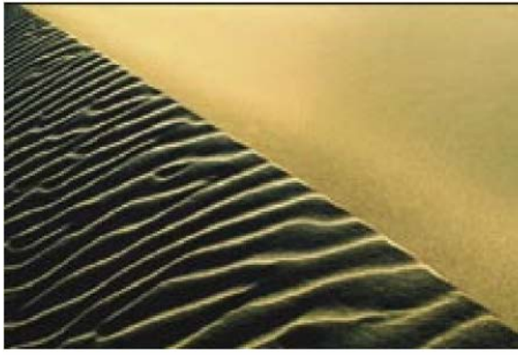
Figure 1: Appearance varies depending on surface contour and the angle of illumination.